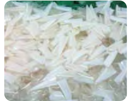
Raw material of Chicken Cartilage

BHN Type II Collagen Powder It is material produced with the high standard, including Collagen Type II and Mucopolysaccharide as structural components of Cartilage. We recommend this product is useful effect on human joint food supplement. Human body include the chondroitin sulfate type A but chondroitin sulfate type A is decreased human body by aging. Type II collagen is suitable for use and better absorption to body.